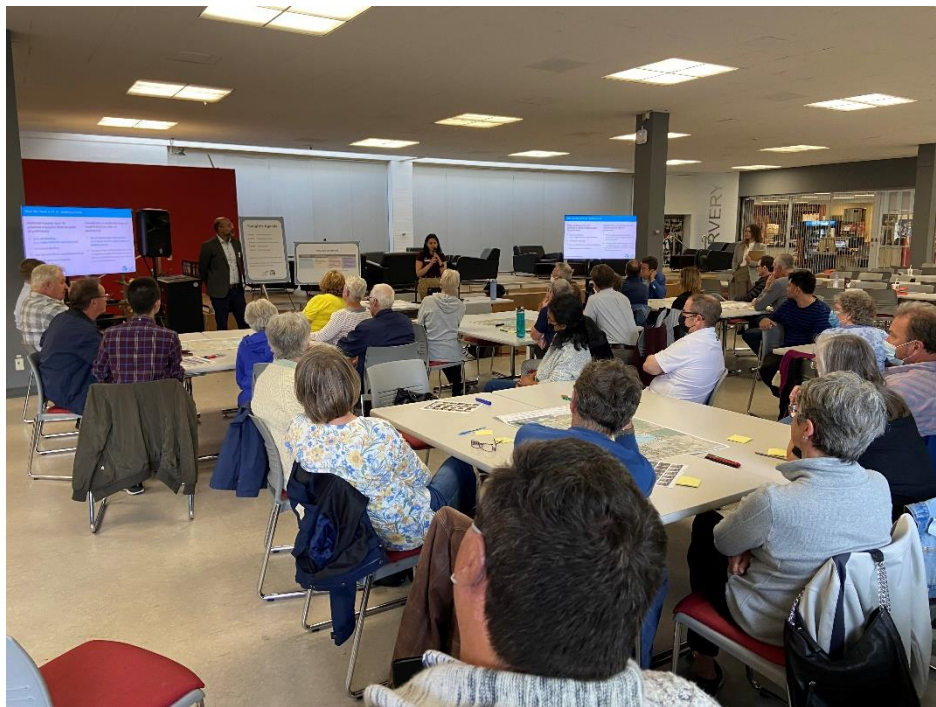
Figure 1: Two members of the project team from Dillon Consulting Limited are making a presentation to the PIC attendees.

This document provides a summary of what we heard at the second Public Information Centre (PIC) for the Loyalist (West) Secondary Plan (LWSP) Update, which took place on September 22, 2022 between 5:00 PM and 7:00 PM. The event was held in person at Loyalist College, and its presentation was recorded for those who could not attend (to watch the recording of the PIC presentation, go to the Loyalist (West) Secondary Plan Update - Public Information Centre #2 Presentation Recording on YouTube at this URL: https://www.youtube.com/watch?v=HcqEnUkbn7M ). The PIC consisted of a presentation, a question and answer period, and an interactive feedback component. In total, 32 individuals attended the PIC (Figure 1).