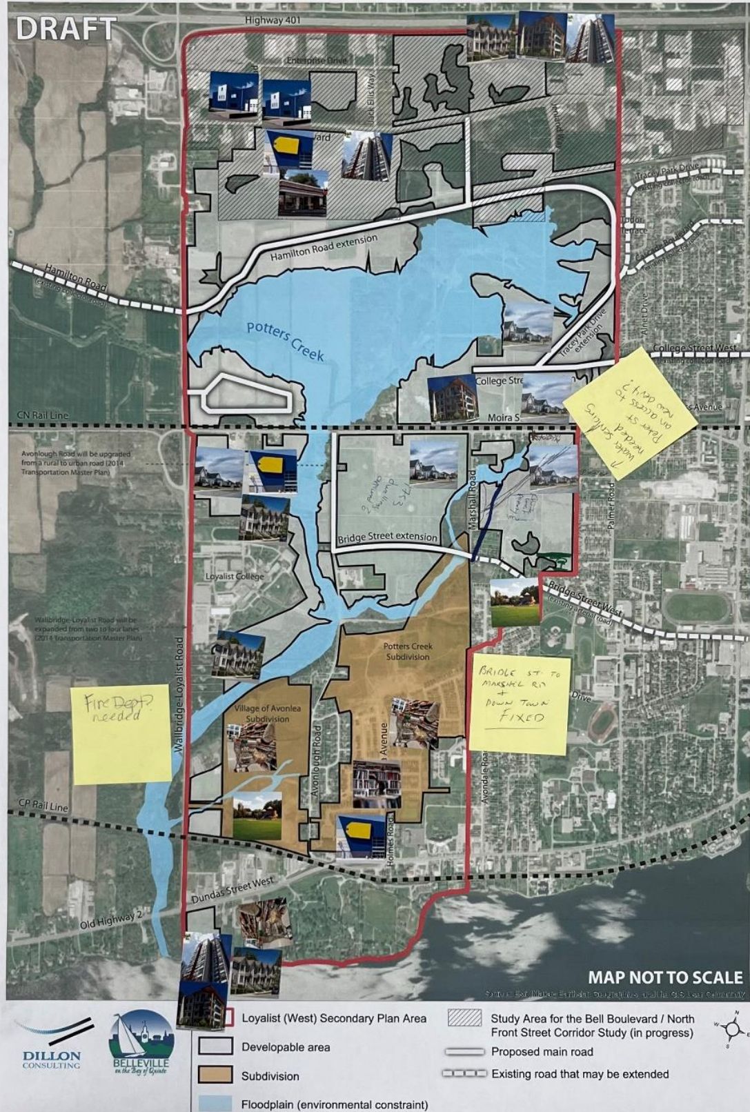
Loyalist (West) Secondary Plan: Public Information Centre #2 Basemap for Concept Discussion, 2022-09-22

City of Belleville Public Information Centre #2: What We Heard October 2022