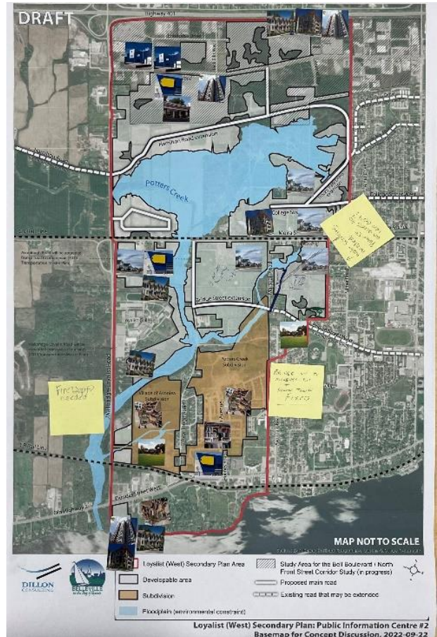
Figure 3: Example of a marked-up basemap with sticky notes and land use stickers.