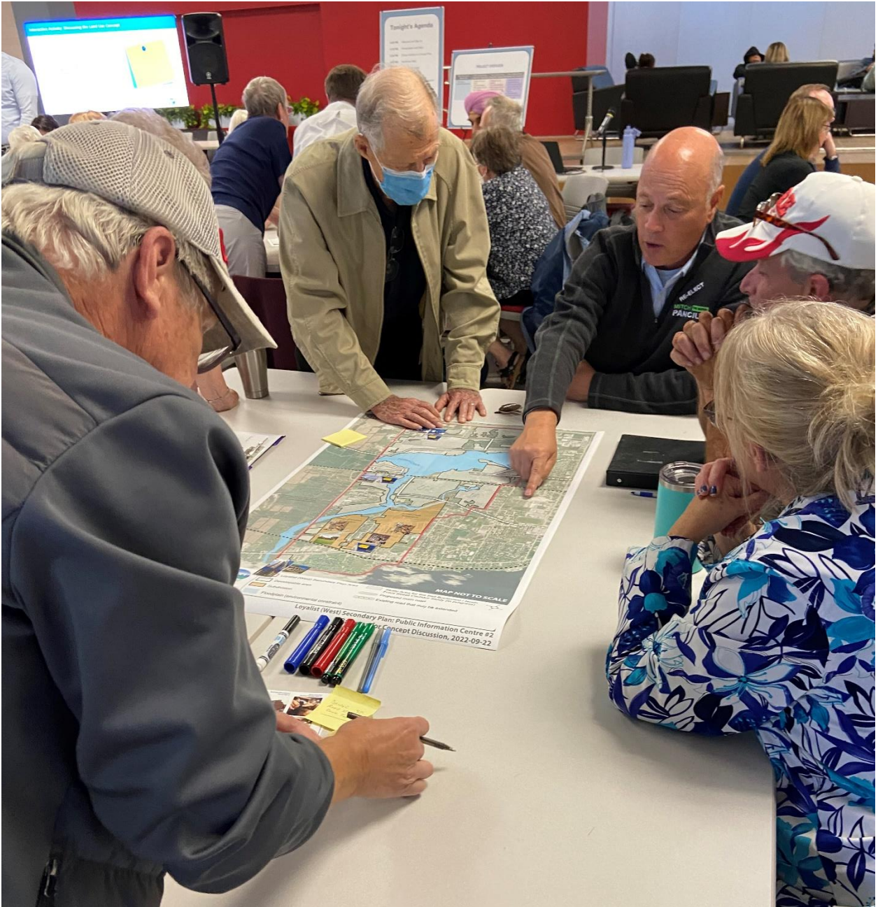
Figure 2: Participants are writing on sticky notes to add to their table's basemap, as well as discussing where they should place the land use stickers.